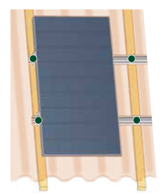
Vertical to the substructure - rafter

Generally, two horizontal cross beams carry one module row. The cross beams are connected to the substructure respectively to the roof cladding by means of roof hooks or special fixation elements.